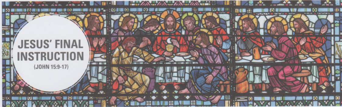
Stained glass depiction of the Last Supper by Joseph Edward Nuttgens (1952) in St Etheldreda's Church, London

Year B • Season Colour: White • Psalter Week 2