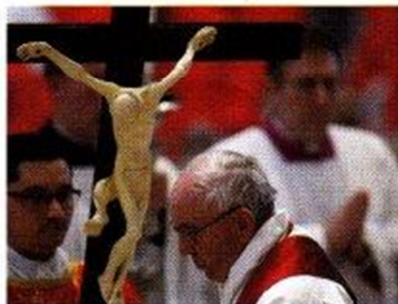
Pope Francis venerates the crucifix as he leads the Good Friday service in St. Peter's Basilica at the Vatican

Look at the crucifix. What (or who?) is your particular cross? Make a special effort in this coming week to accept your cross as part of your following of Jesus with his.